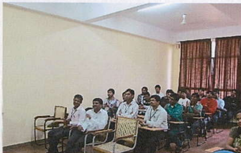
Glimpse of the session

Team members were appreciated and participants were acknowledged for their involvement in the learning process. Participants were quite happy and satisfied with the knowledge gained and thanked the trainers for such a great initiative.