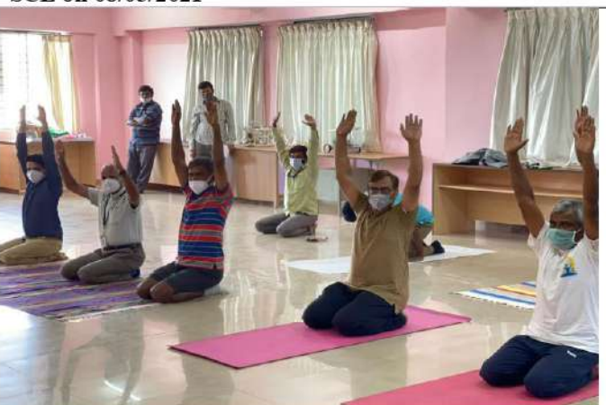
Yoga Event on “Yoga during Pandemic to achieve Equanimity” for faculties and staff of SCE on 21/06/2021