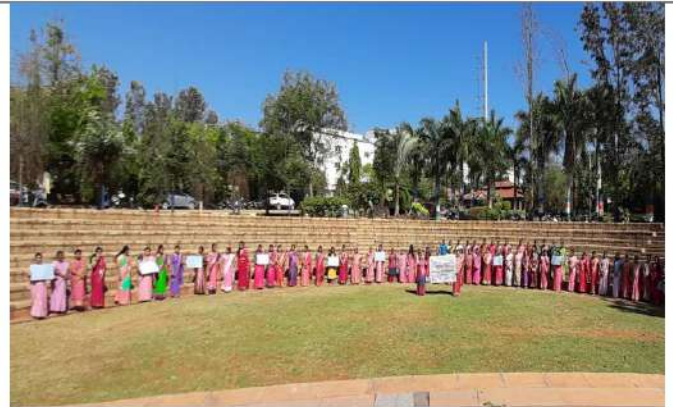
Contactless Human chain was formed to spread awareness about “Prevention of molestations and Harassment during Pandemic” lady faculties and staff of SCE on 08/03/2021