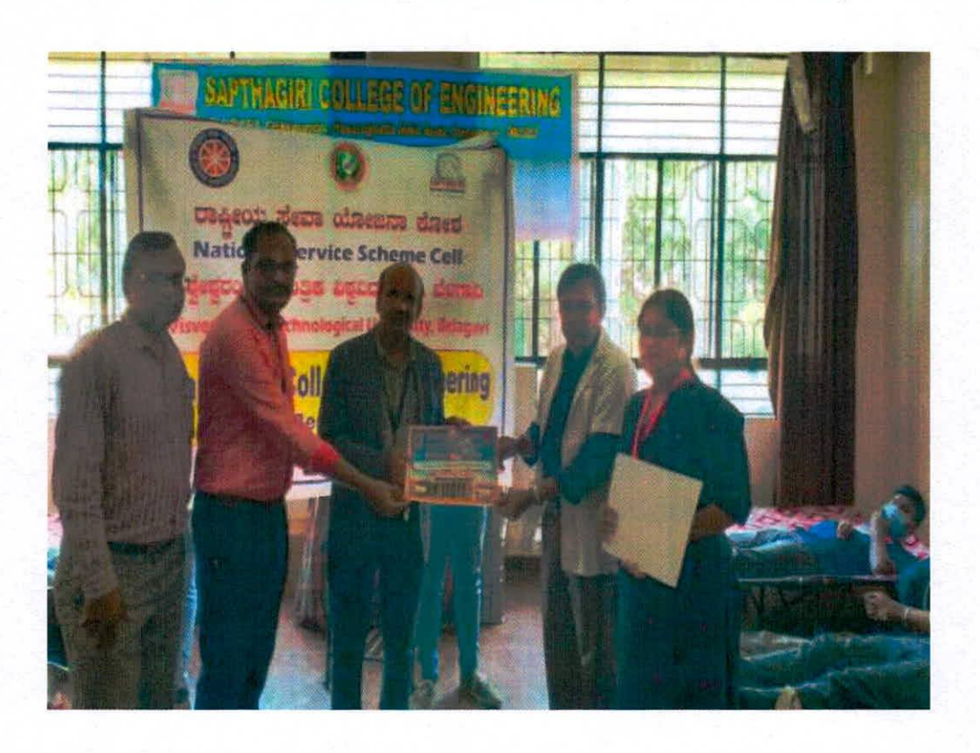
Certificate of Appreciation by Red Cross to our college and NSS unit