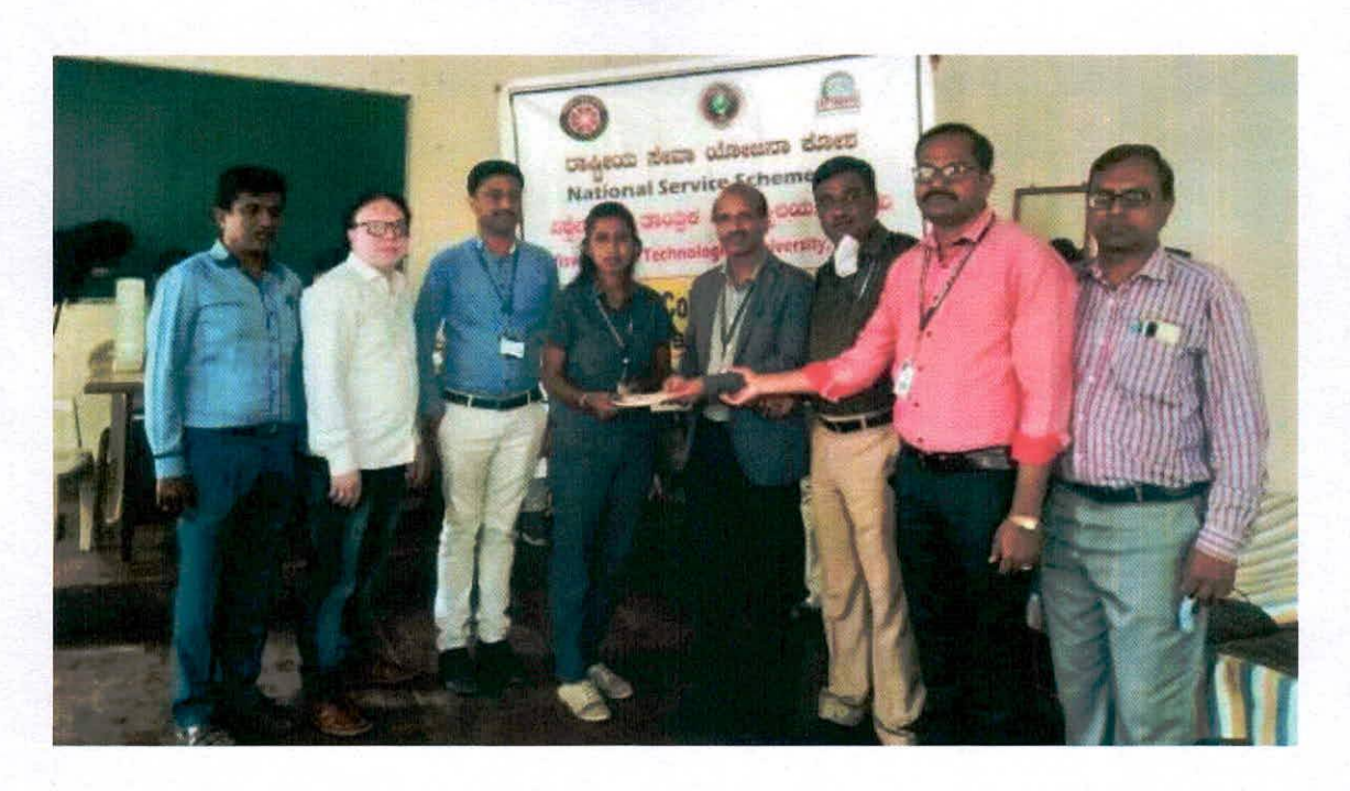
Blood Donation Certificate given to the student by our beloved Principal