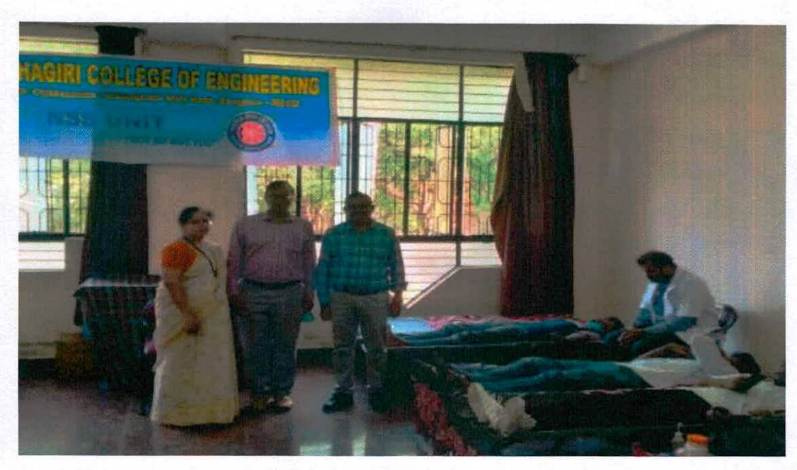
Faculty's taking care of the Students donating blood