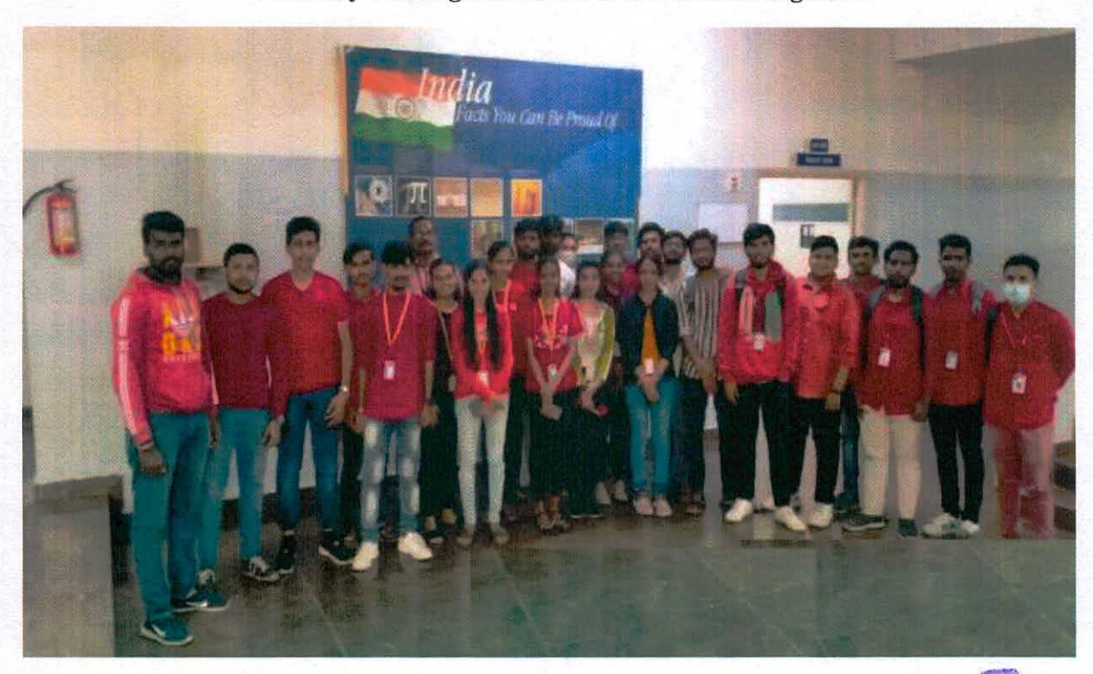
Student Volunteers of SCE