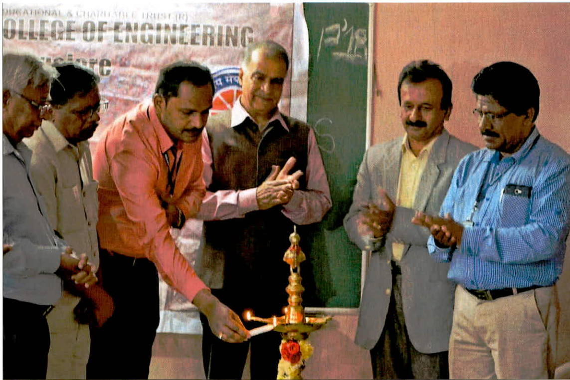
INAUGURATION FUNCTION OF BLOOD DONATION CAMP

Principal Sapthagiri College of Engineering Chikkasandra, Hesareghatta Road, Bangalore-560 057