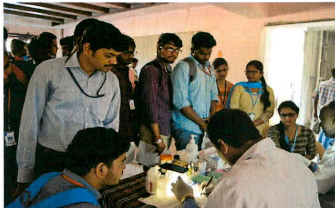
STUDENTS PRE-CHECK UP BEFORE DONATING BLOOD

Principal Sapthagiri College of Engineering, Chikkasandra, Hosareghatta Road, Bangalore-560 087