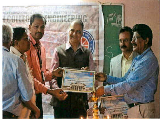
HAND OVER OF DONATED BLOOD PACKET TO INDIAN RED CROSS SOCIETY