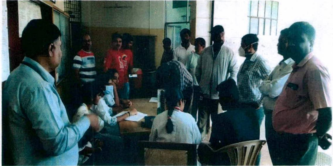
Volunteers registering for blood donation