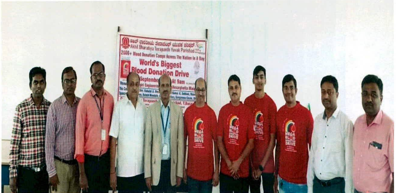
Group photo with ABTYP and SIMS & RC members