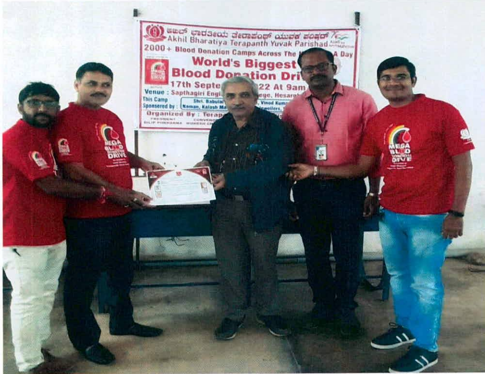
Blood Donation Certificate given to the volunteer by ABTYP members