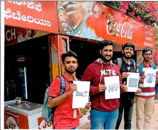
Awareness inside the Campus