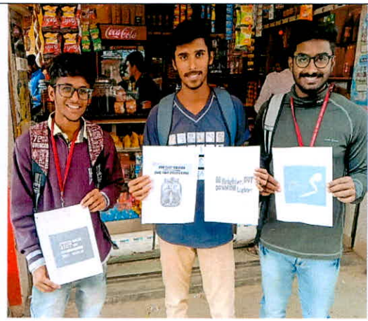
Posters Presentation to public