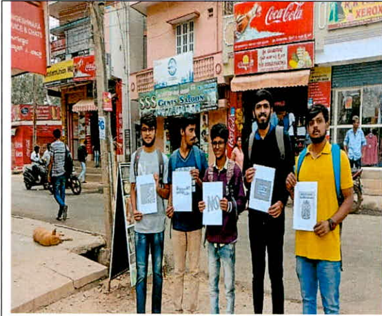
Posters by Students