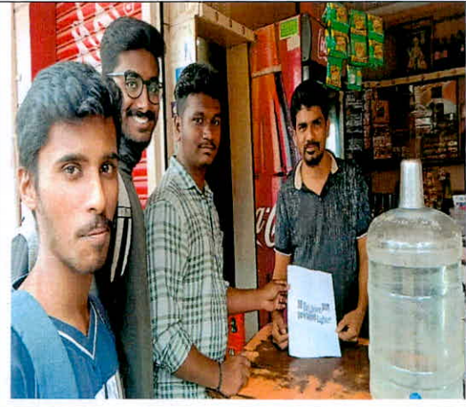
Awareness to Public