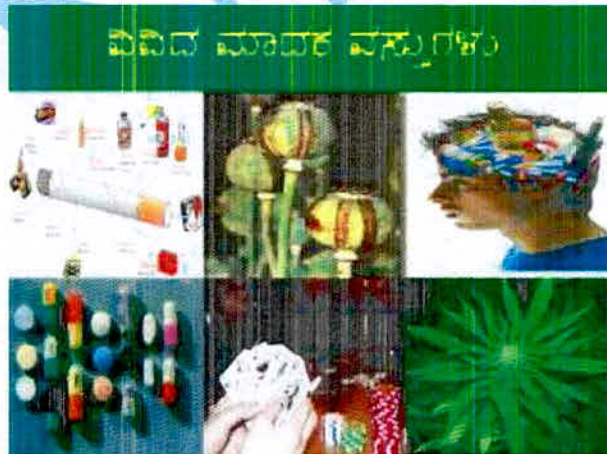
Different drug forms