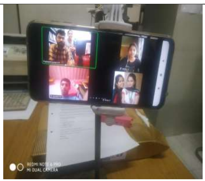
Interaction of Alumni with participants