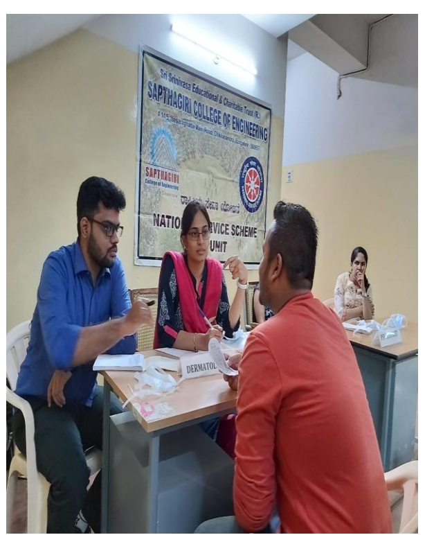
Doctors diagnosing the students