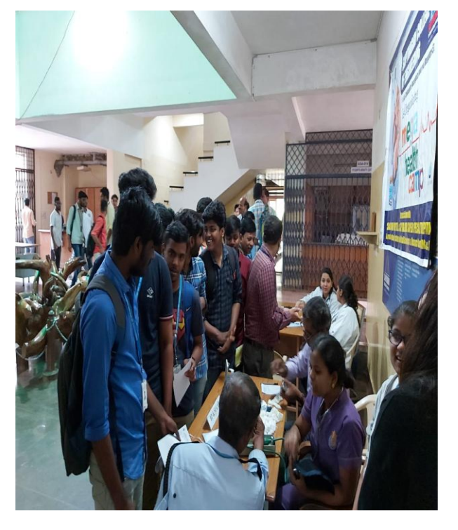
Normal checks for students in Health camp