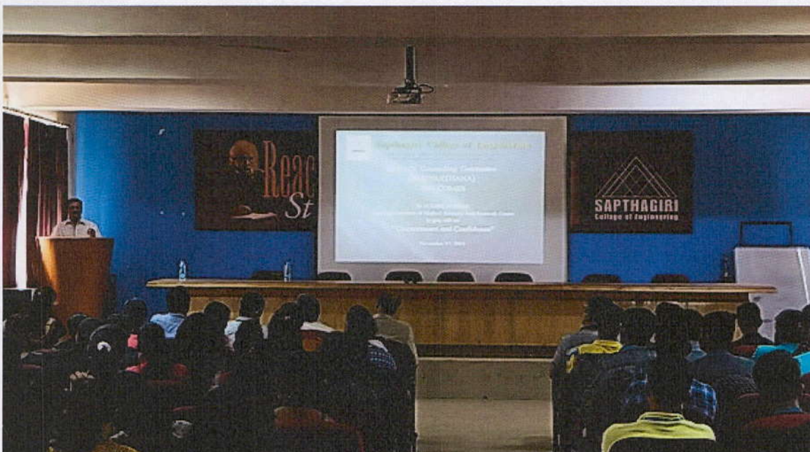
Expert delivered talk on commitment and confidence

Around 25 I year students were benefitted from this event.