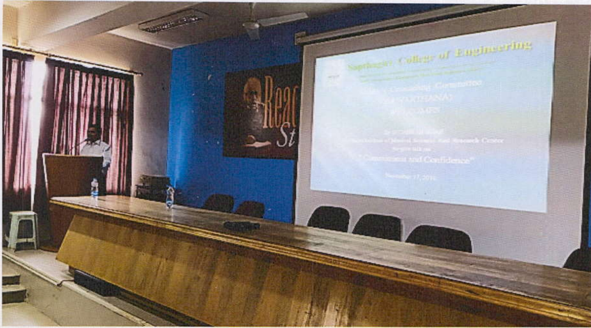
Expert delivered talk on commitment and confidence

Principal Sapthagiri College of Engineering Chikkasandra, Hesaraghatta Road Bangalore- 560 057