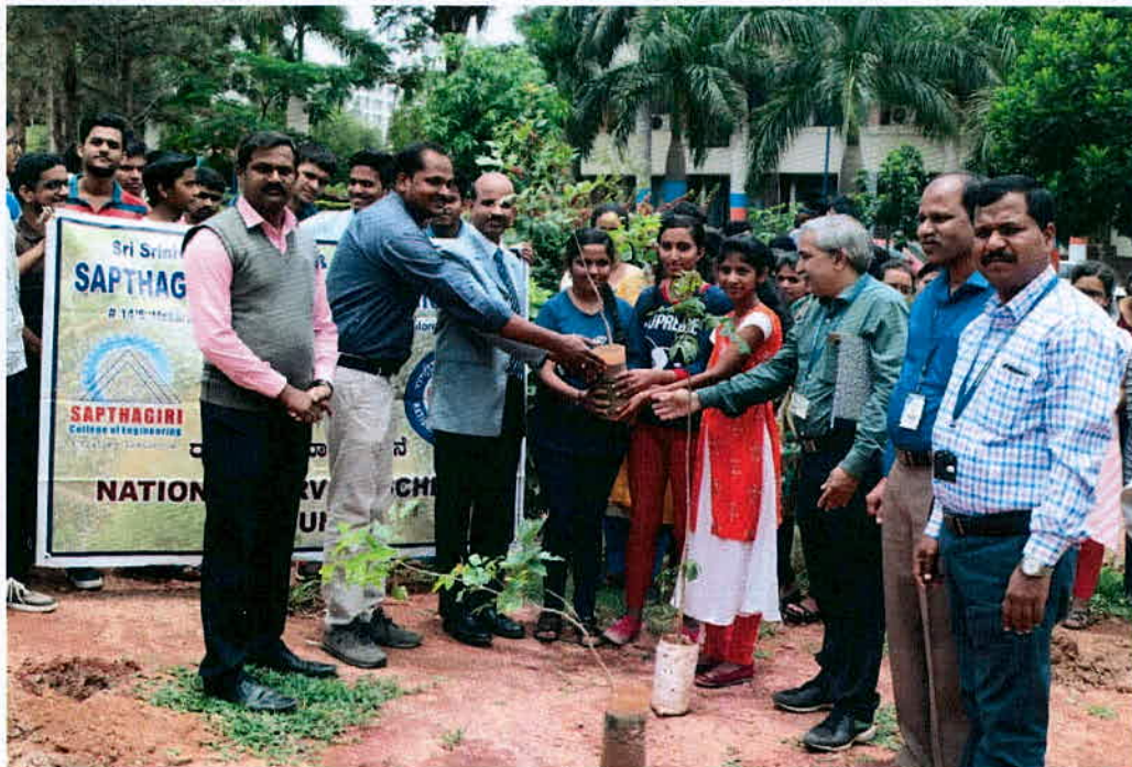
Sapling the Plants (One Student One Tree)