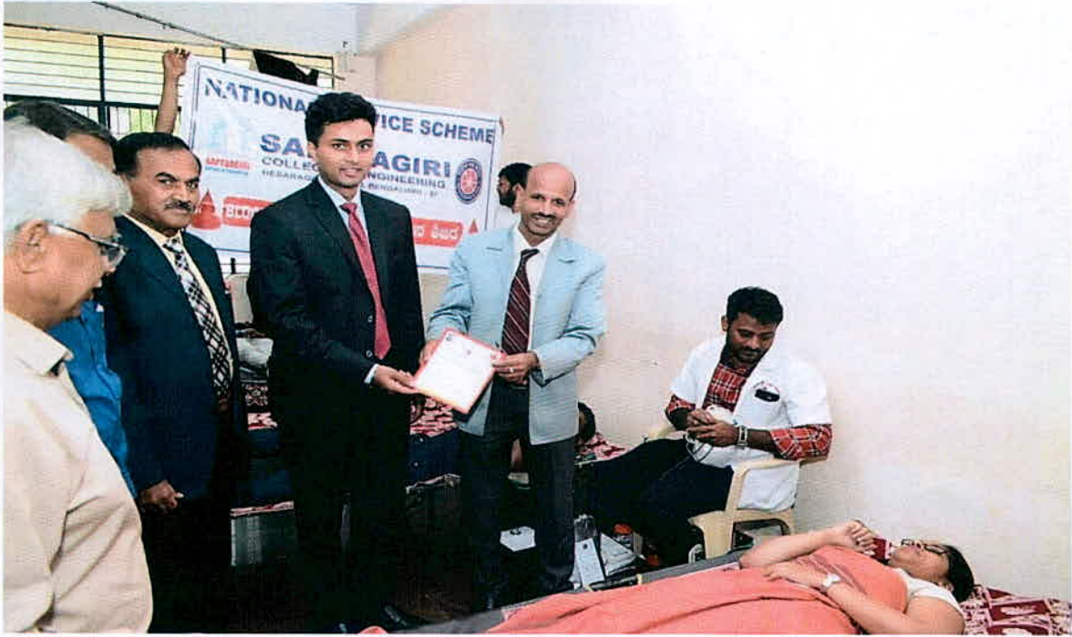
Mega Voluntary Blood donation Camp