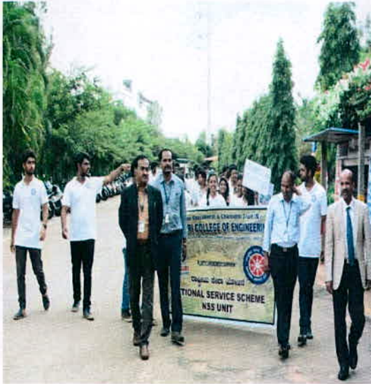
Plastic awareness Jatha