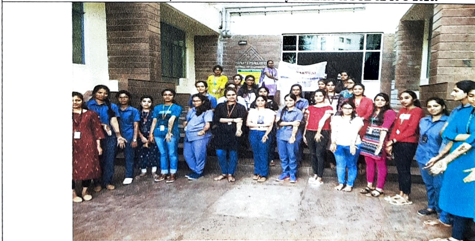
Mehendi event about “Enhancement of Artistic Skills to bring Equality” was conducted for the girl students of SCE on 24/09/2019.