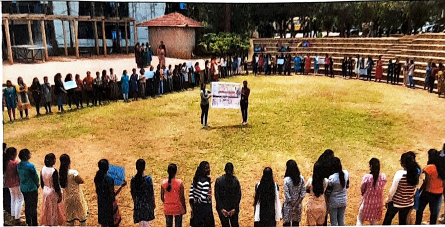
Human chain was formed by the students of SCE in the college campus to spread awareness about “Women’s Rights and Gender Equity” on 15/11/2019