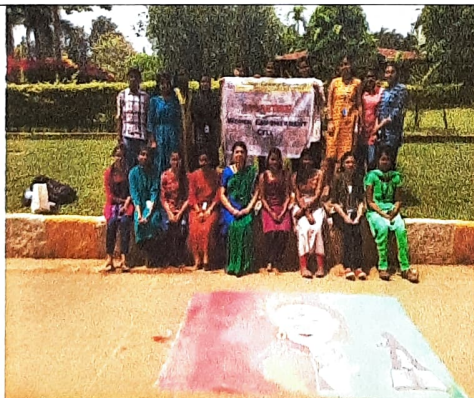
Rangoli event about “Women in various fields to achieve Equality” was conducted for the students of SCE on 05/03/2020.