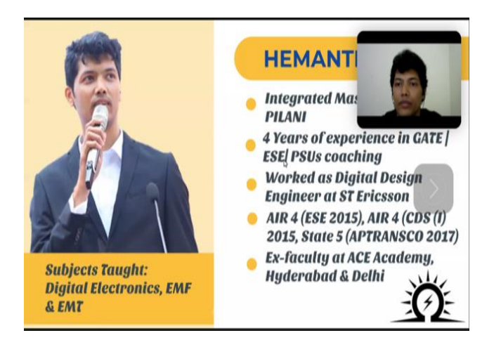
Introduction of the speaker

The objective of the webinar was to help aspiring students to acquire a challenging engineering career in life. He gave information about OHM institute which is a leading education consultancy and having a common goal of providing the best quality guidance to the Electrical and Electronics Engineering students community and setting new benchmarks through innovative pedagogical methods aimed at making the overall learning and test preparation.