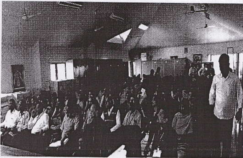
Fig: discussion about revised concepts of NAAC process

The speaker explained NAAC process and its importance of NAAC in today's world, faculty from all departments attended the Workshop from Jan 21 st 2017 to Jan 23 rd 2017 in Sapthagiri college of engineering. While designing the structure of program it was kept in mind that all the faculties should aware of importance of NAAC.