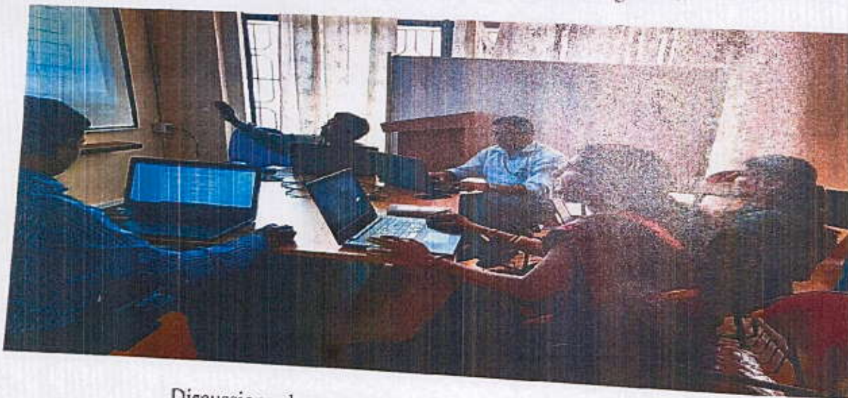
Discussions about revised concepts of Bloom's taxonomy

The curriculum was planned to understand the importance of Bloom's taxonomy during the delivery of lectures and in turn improve the delivery quality of teaching levels.