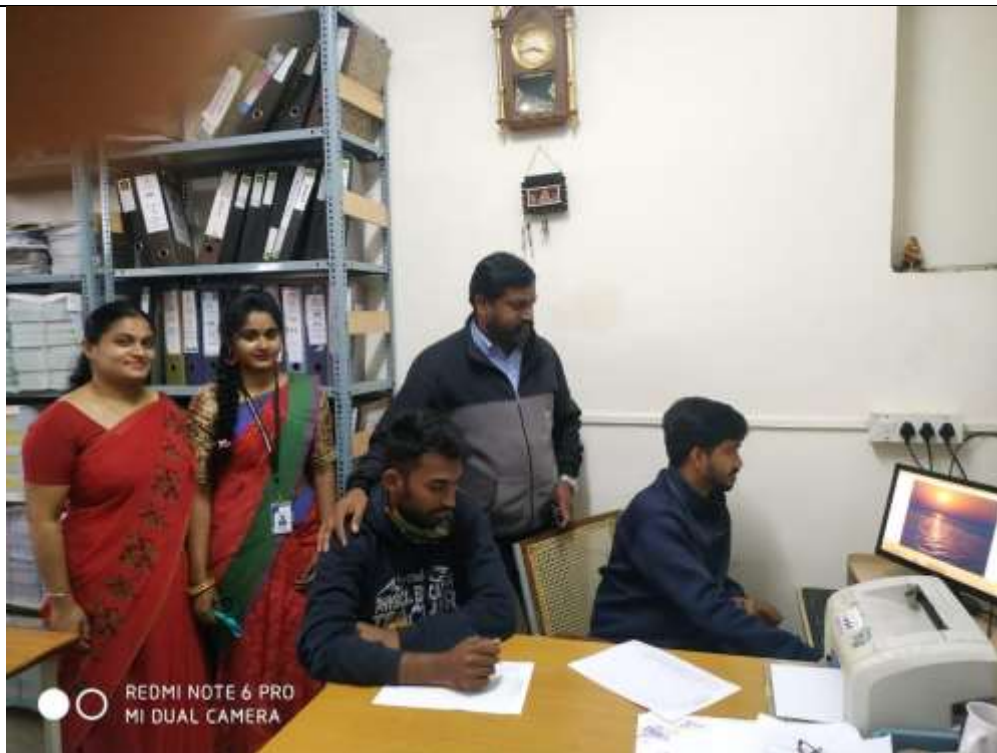
Judges along with team members discussing about Selection process