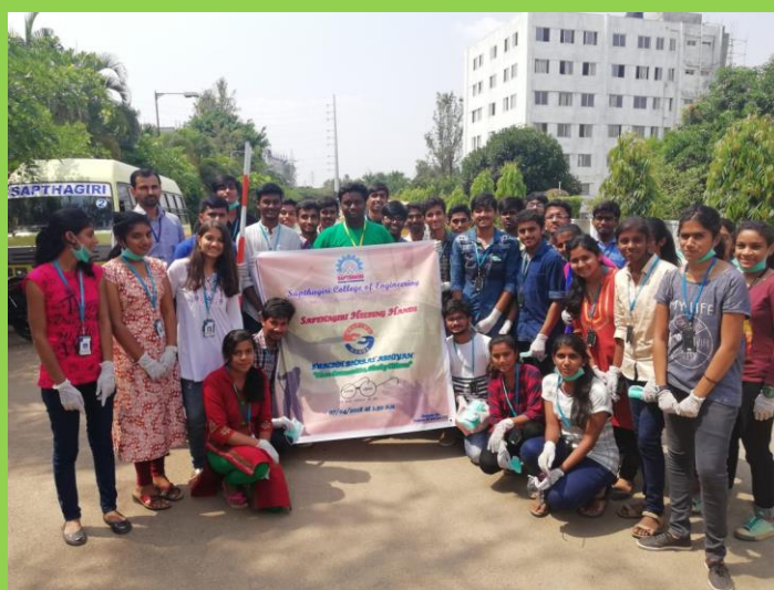
Group photo with team involved in Swachh Bharat Abhiyan