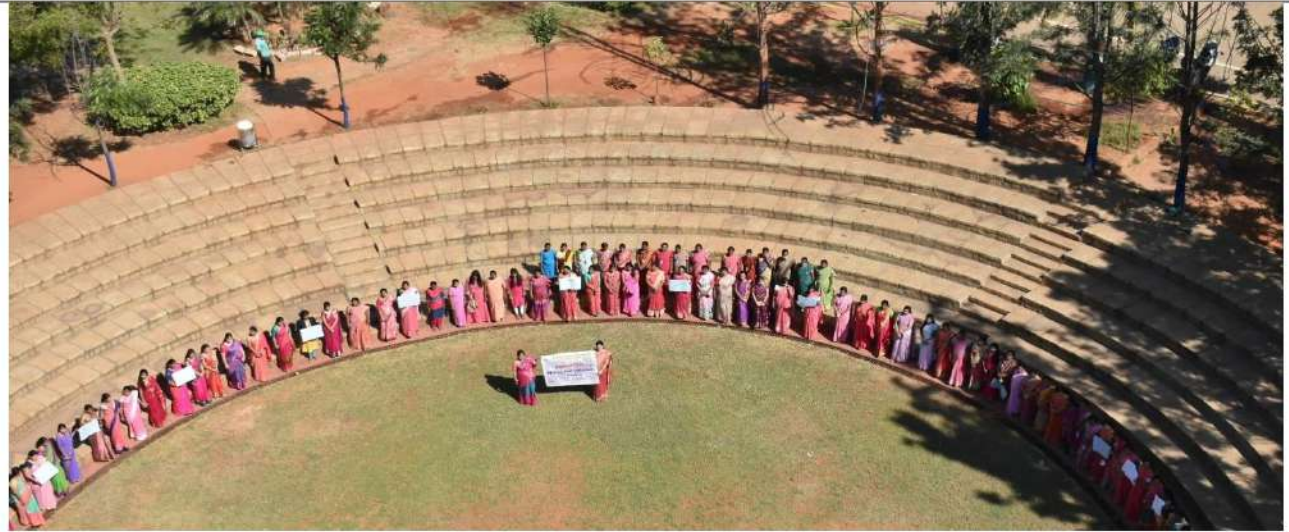
Contactless Human chain was formed by the lady faculties and lady staff of SCE in the college campus to spread awareness about “Encourage Women for Higher Education” on 08/03/2021.