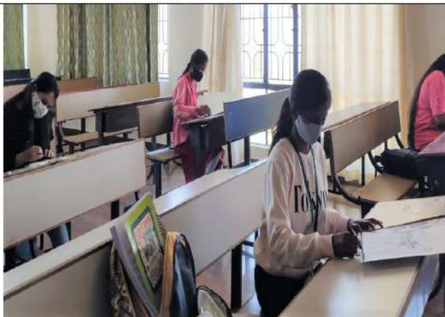
Sketching event about “Women in different fields- Depicting Equality” on 08/03/2021