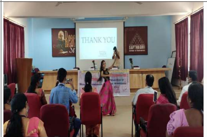
Dancing event to “Encourage the skillset of girl students to bring about Equality on 08/03/2021