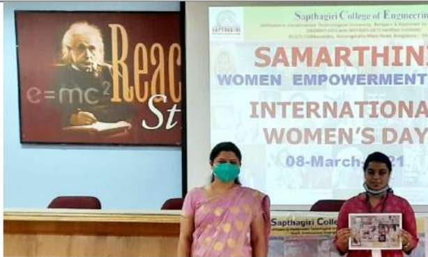
Distribution of certificates to girl students who are toppers and winners in various events on 08/03/2021.