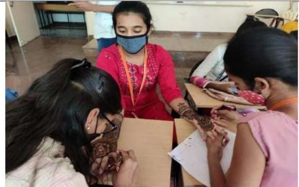
Mehendi event about “Enhancement of Artistic Skills to bring Equality” on 08/03/2021.