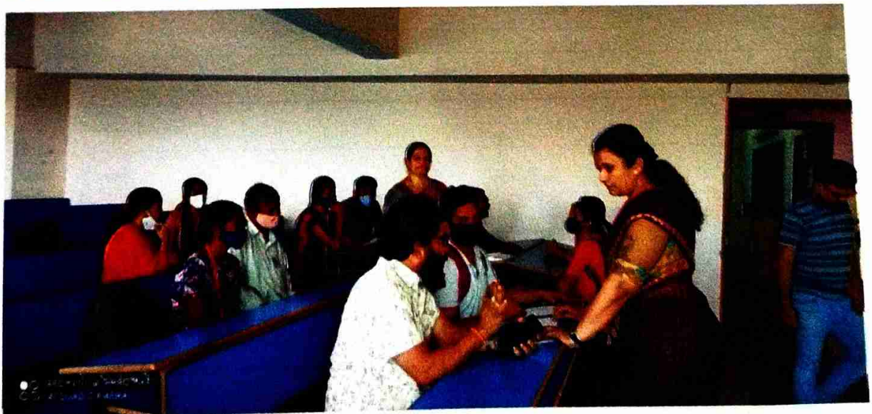
Faculty interaction with parents